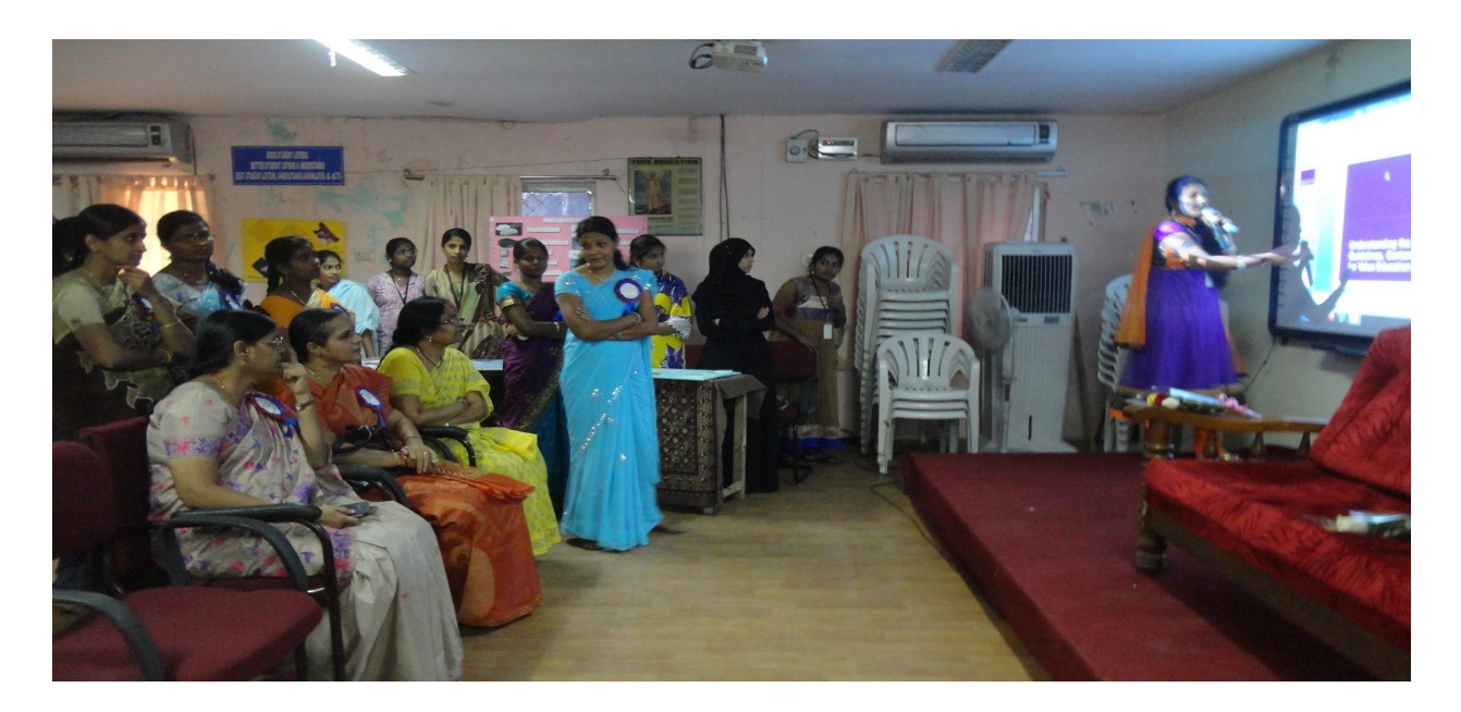
Usage of Smart Board by the students for student presentations